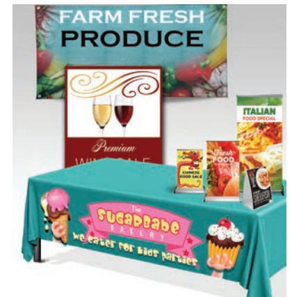
Food and Beverage